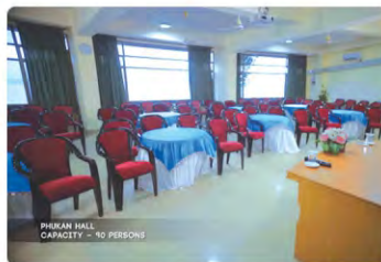
PHUKAN HALL Capacity - 90 persons