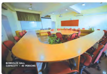
BORDOLOI HALL Capacity - 40 persons