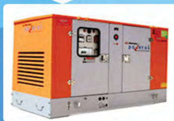
24 HOURS POWER BACKUP