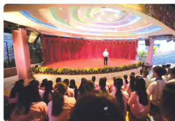
AMPHITHEATRE Capacity - 400 persons