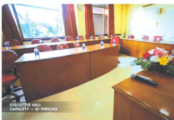
EXECUTIVE HALL Capacity - 30 persons