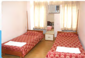
DOUBLE - BEDDED ROOM