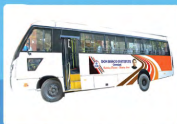
TRANSPORTATION Capacity - 36 / 27 / 13 (AC) persons