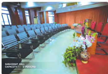
SARAIGHAT HALL Capacity - 200 persons